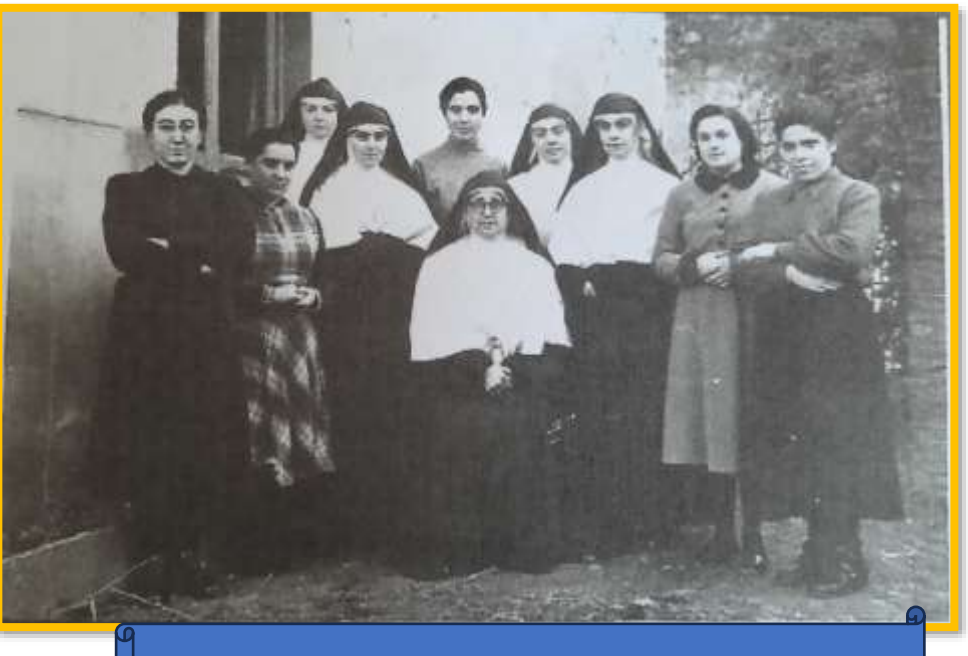
First aspirants to Marist life

The aspirants to the Marist life stayed with them for about six months and then went to the formation House in France, Massabielle - St. Prix.